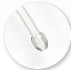
OLIVE Enables atraumatic and reliable insertion